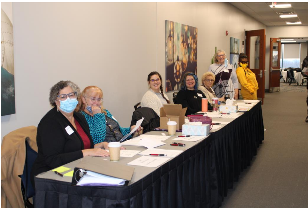
2021 SCOPE Day Registration