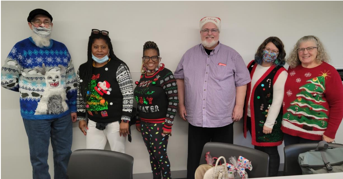
Executive Board Meeting December 2021