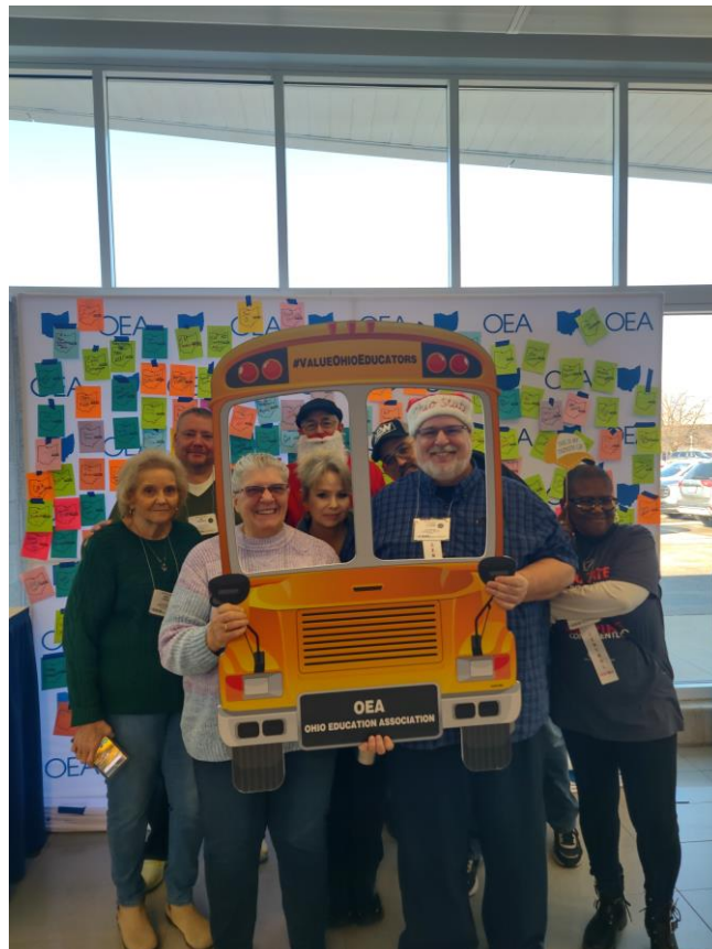
SCOPE Representatives at the OEA RA

Section (B) Amendments to this Constitution may be made by a secret mail ballot of a two-thirds (2/3) majority of the voting membership provided that the amendments have been introduced in writing to all members at least two (2) weeks before the vote.